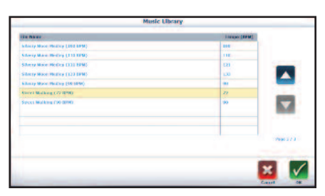
1. Select appropriate song from library

The Gait Trainer 3 provides real-time biofeedback and quantifiably displays step length, step cadence (spm) and step symmetry. With the Music Therapy option, the Gait Trainer 3 serves as a platform for rehabilitative collaboration.