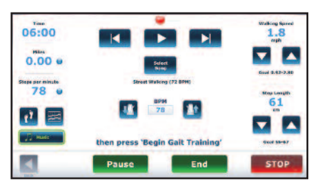
2. Adjust tempo