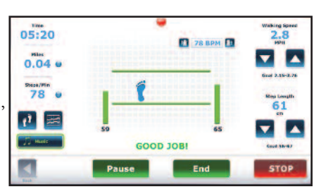
3. Provide gait training biofeedback with music therapy