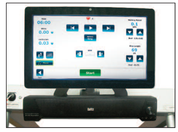
Sound Bar shown beneath the Gait Trainer 3 display.

The Music Therapy option for the Biodex Gait Trainer 3 is accessed via USB flash drive that activates the music player software. A library of music therapy-informed compositions, as well as